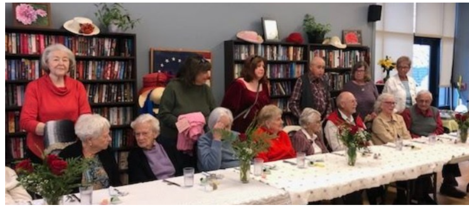
Pictured Above: A touching moment at our 90 Plus Birthday Party and General Membership meeting where prayer shawls were given to our 90 plus members!